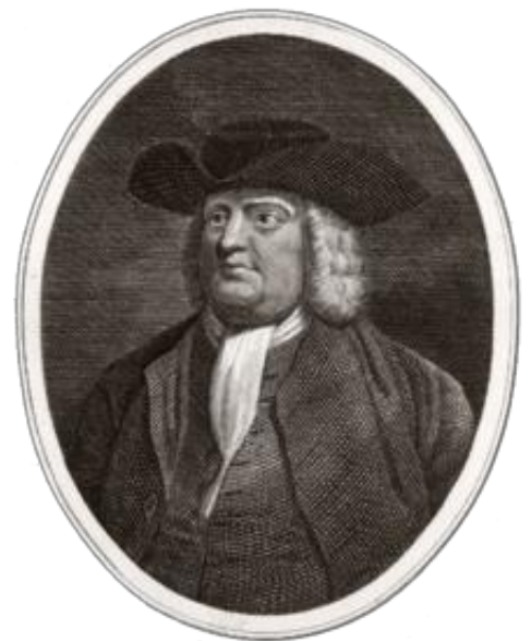
Portrait of William Penn

The Quakers believed in religious freedom and did not believe in religious rituals or ceremonies. They were very peaceful and did not fight in wars or believe in slavery. Penn wanted to create a colony that was not just for Quakers, but was free for all who chose to live there. He wanted to live in peace with the Native Americans and bought land from the Lenni Lenape Indians that lived there. He wanted everyone to live fairly and peacefully, no matter what church they attended.